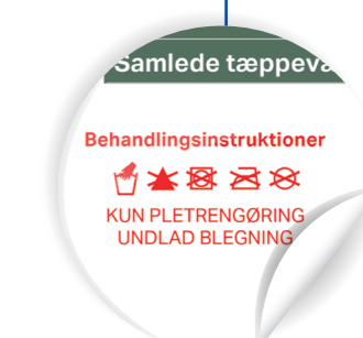
Highlight key care instructions