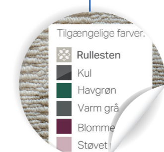
Indicate other colours available in the range