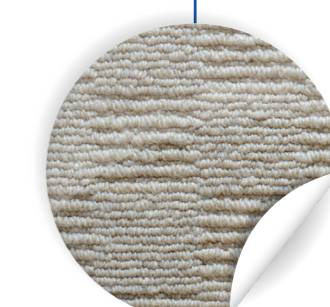
Show colour and texture of product