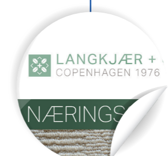
Present company logo in brand colours