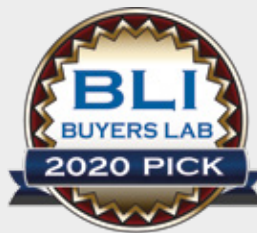
Epson EcoTank L6580 Outstanding SOHO Colour Inkjet All-in-One

The Epson EcoTank L6580 has claimed a BLI Summer 2020 Pick Award for Outstanding SOHO Colour Inkjet All-in-One.